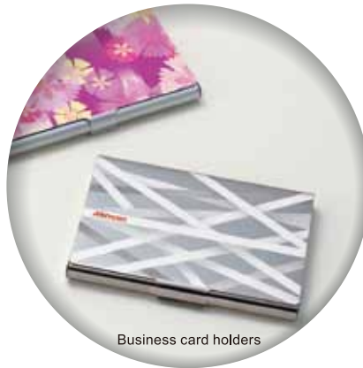
Business card holders