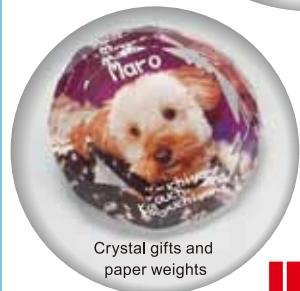
Crystal gifts and paper weights

Compact & Tabletop Printer for everything up to 50 mm thickness